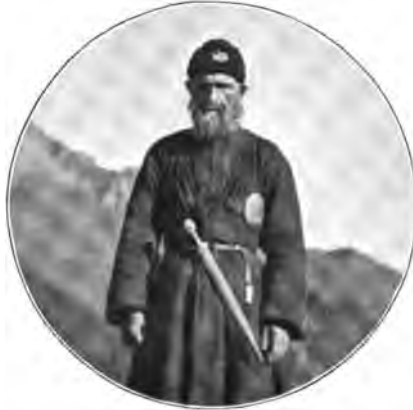
GOVERNMENT FOREST-KEEPER, KOUBAN.

We crossed the river Arkhyz, and ascended the lower wooded hills on the opposite side of the Arkhyz valley. On getting above the timber line and reaching the high pastures, we soon came to the conclusion that we need not expect to find Tûr or Chamois, for sheep and horses