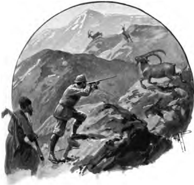
“FINISHED HIM AT CLOSE QUARTERS.”

of the stalk we had undertaken. Moreover, there was great probability that the animal had gone unnoticed, for as we came up we found plenty of ravines which might have afforded him shelter, and which we had not been able to see from afar. Redoubling my precautions, I now crept on alone, and, to my great amazement, there came in sight first one, then two other Tûr lying on a moraine some eighty yards below.