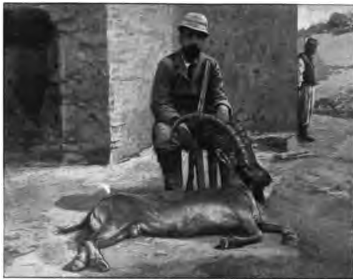
THE BEST HEAD.