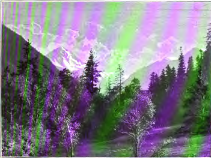
ON THE WAY TO THE ZAGDAN VALLEY.

prise we suddenly startled a herd of six Chamois, which were grazing on the camp side of the near ridge of the corrie. They were not very much frightened, and gently trotted over the ridge and up the corrie. We followed their direction for about