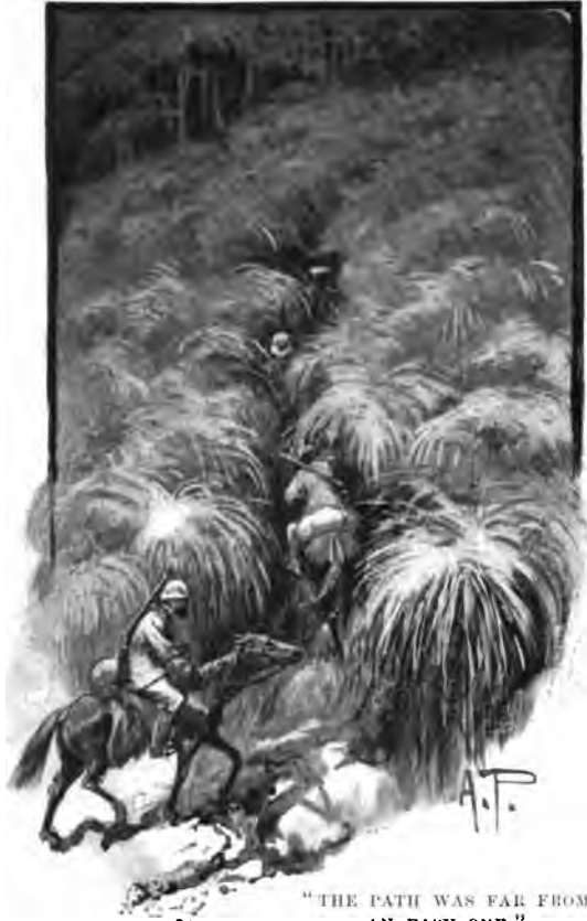
"THE PATH WAS FAR FROM AN EASY ONE."

which often measured from twelve to fifteen feet. As we got higher they became gradually scarcer, being replaced by birch, pine, and fir trees, the latter of