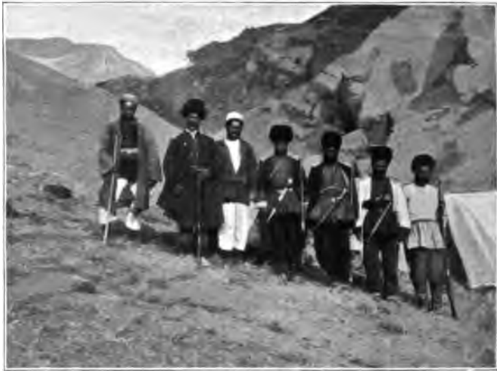
OUR HUNTERS ON THE PERSIAN FRONTIER.