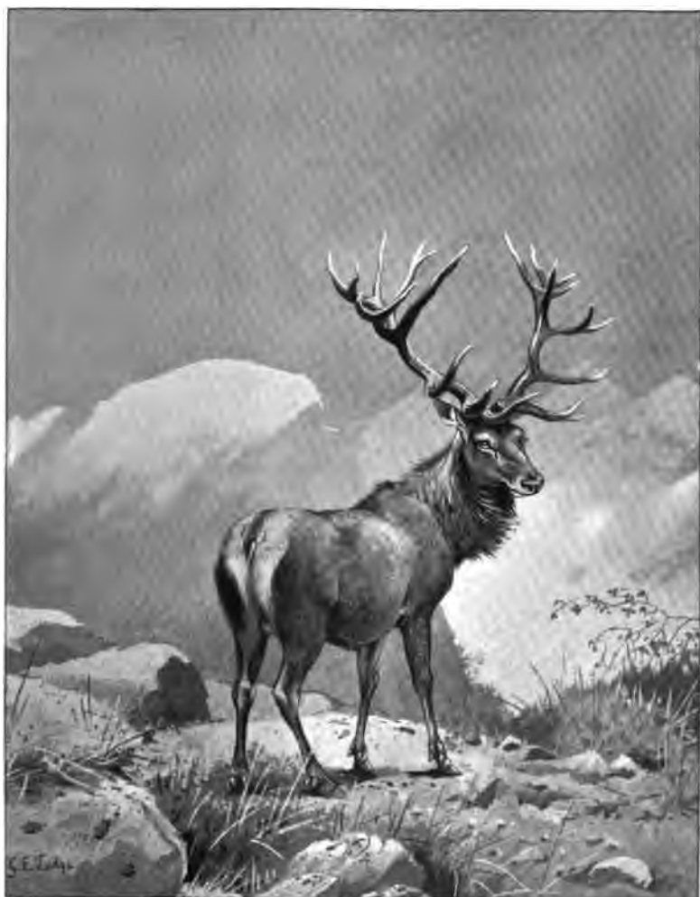
THE CAUCASIAN STAG.