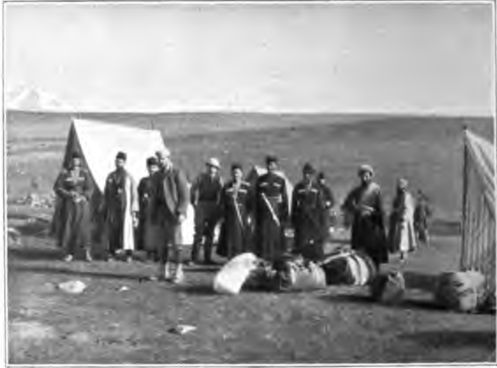
HUNTERS AND CARAVAN MEN, ALAGUEUZ.

went in search of the camp, and after about three hours' walking we were relieved by finding it.