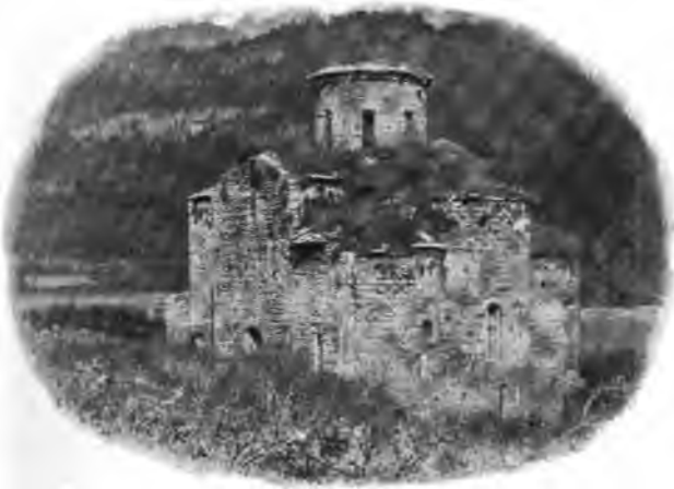
RUINS OF ANCIENT CHURCH IN THE ZELLENTCHUK VALLEY.

starting. The packmen said that owing to the difficulty of the road their horses would not be able to carry the 200 lbs. estimated as a reasonable load for each horse, so two more men and four more horses had to be procured before we could start. Our caravan now consisting of twenty-two pack-horses led by eleven