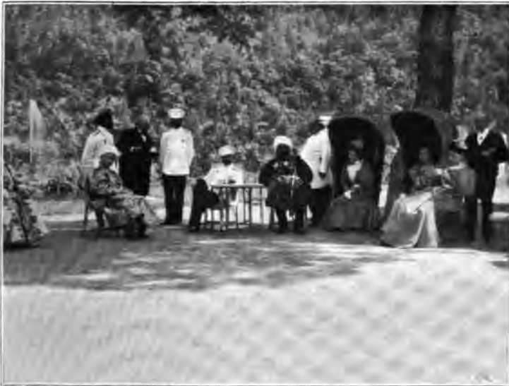
GUESTS OF THE GRAND DUKE AT BORJOM.

a man who had been courageous enough to accept the responsibility of wives to the number of 232, as was the case with him. Although his oriental appearance brought to my recollection early impressions of certain Eastern tales, yet his kindly