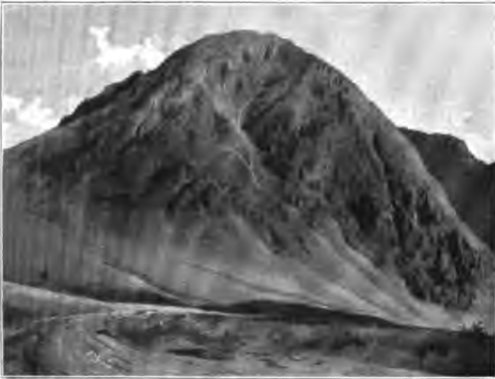
IBEX ROCKS OVERLOOKING THE ARAXES VALLEY.

The third and last stalk here was unsuccessful and short, as a return to Nahitchevan was included in