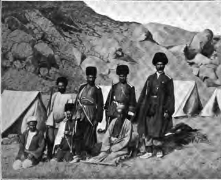
NATIVE HUNTERS, DARI-DAGH.

were materially helping D. by making as much noise as possible. Their idea apparently was to disturb any game that might lie hidden, observe the direction it took in its flight, and then follow it up in the