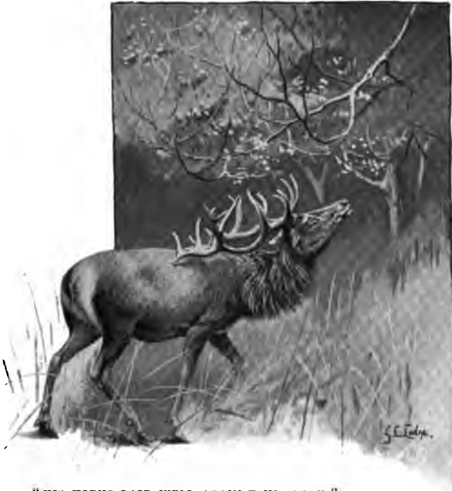
"HIS HORNS LAID WELL AGAINST HIS BACK."