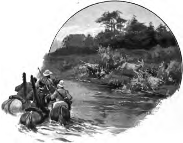
"OUT DASHED A HIND, FOLLOWED BY A HUGE SPOTTED CAT."

This was the first time I had seen a Leopard in these parts, although I had several times heard of them from the hunters, who had never succeeded in shooting one. Some years ago two Leopards had been poisoned within