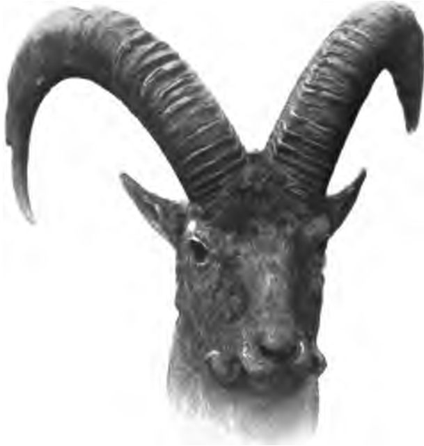
HEAD OF CAPRA CAUCASICA.

On the morning of September 28th, at 8 a.m., our caravan began to advance slowly down the Lesser Laba valley in the direction of Psebai, which we reached late in the evening, after a thirty-five mile march, and on the following day we bade good-bye to the happy hunting grounds of the Kouban district.