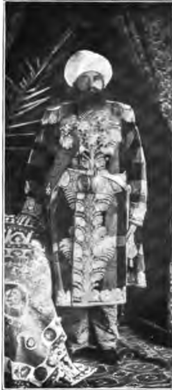
THE EMIR OF BOKHARA.

The reception of the Emir was quite an impressive ceremony. As the eastern potentate, accompanied by his son and Prime Minister, drove up, the Grand Duke's military band, over forty strong, struck up music appropriate to the occasion, and His Highness received his illustrious visitors with befitting pomp and ceremony. The Emir, who was dressed in oriental costume, wore the epaulets of a Cossack regiment, of which he was an honorary general, and two richly bejewelled orders; one presented to him