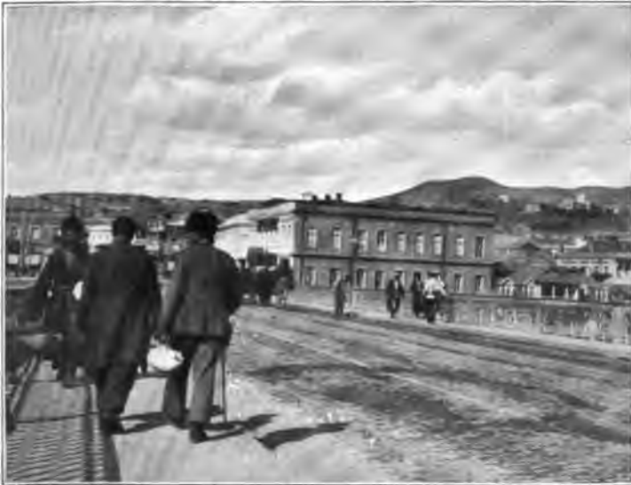
MAIN BRIDGE, TIFLIS.

After dinner we went in a body to one of the gardens patronized almost exclusively by Armenians, and with the exception of a few favoured Russian and