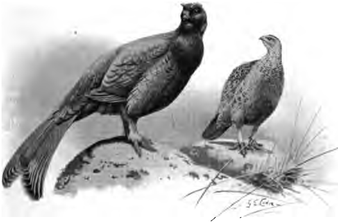
THE CAUCASIAN BLACK-COCK.

The other game bird which abounds in the Caucasus is the native Black-cock ( Tetrao Mlokocieviczi ). It also lives among the rocks above the timber line, and in the rhododendron bushes, where I have often