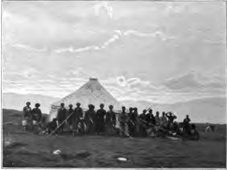
OUR CARAVAN MEN.

beckoned me to come up, giving me to understand that we had at last found Bruin at home. I was wearing boots with nails, and hesitating to walk over the sharp rocks in my stockinged feet, unfortunately had not removed them.