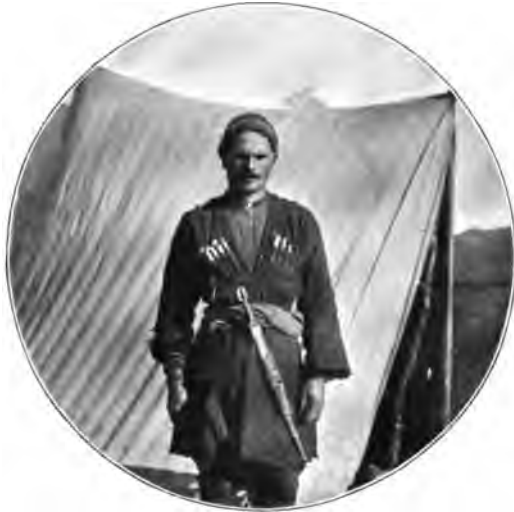
NATIVE HUNTER, USOUP.

of him, he fed quietly on, evidently not seeing us. We descended to within about 120 yards over the snow and rocks, and found the best head lying end on, and the other one partly hidden by a rock. I drew a bead on the former, and on firing he stood