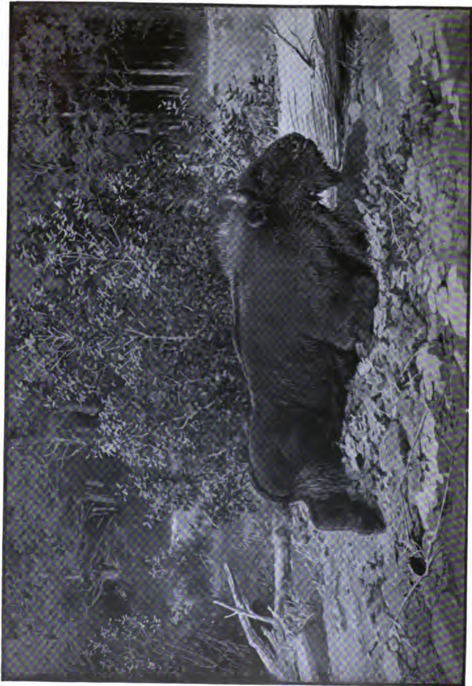
DEAD AUROCHS ( BOS (TAURUS) ).