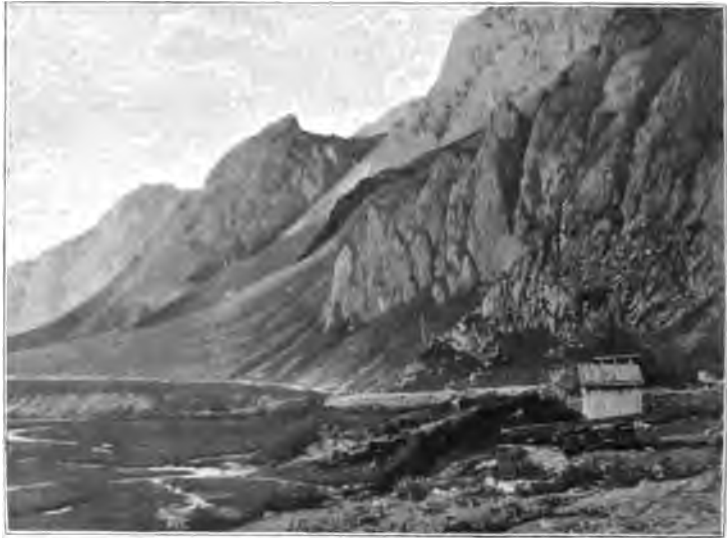
ON THE GEORGIAN ROAD.

the great Georgian road across the main range of the Caucasus, a distance of 200 versts. This road is a marvellous piece of engineering, constructed by the Russian authorities for military purposes. In places it has been cut out of the solid rock, so that on one