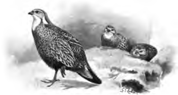
THE SNOW PARTRIDGE.

There is a saying in the Caucasus that these birds warn the Tùrs of danger by their call; for my part I have always remarked the contrary, and they have constantly brought me luck.