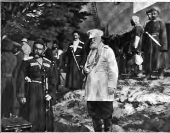
NATIVE AND RUSSIAN OFFICERS.

science written in Persian, but actually being able to read it. His geography, however, was lamentably weak, for he was possessed with the firm belief that Japan bordered on Persia. He showed us every hospitality in his power, although his cuisine was