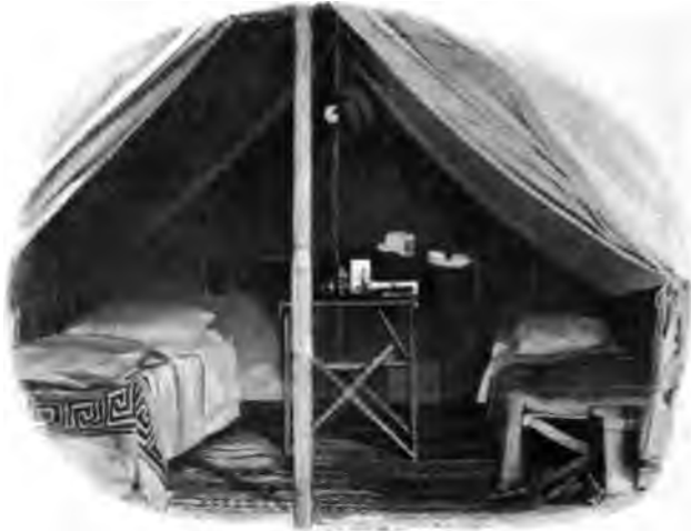
OUR HOME, PERSIAN FRONTIER.

appeared over the farthest ridge. Game seemed somewhat plentiful here, for very soon another herd of eight Ibex were seen amongst the rocks on the side of the valley away from the Araxes. They were a long way off, and it was decided to leave