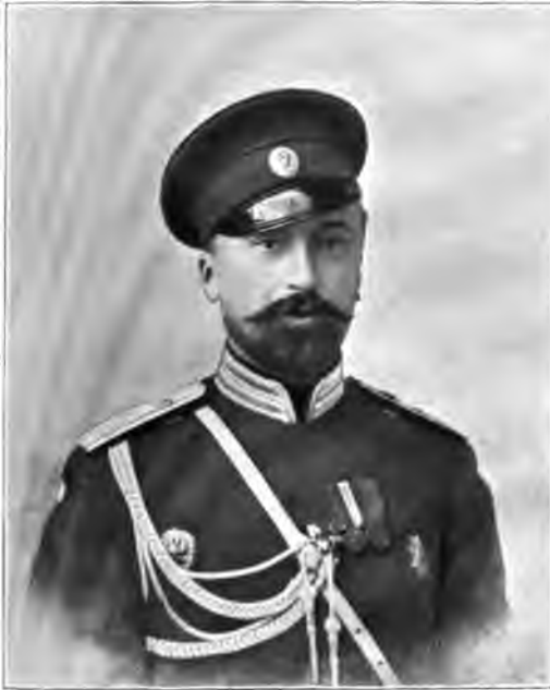
THE GRAND DUKE NICHOLAS MIKHAÏLOVITCH.

on a line opened by the Grand Duke Michael. On approaching Borjom the country became more mountainous, and we reached our destination by ascending a valley with pine-covered hills converging