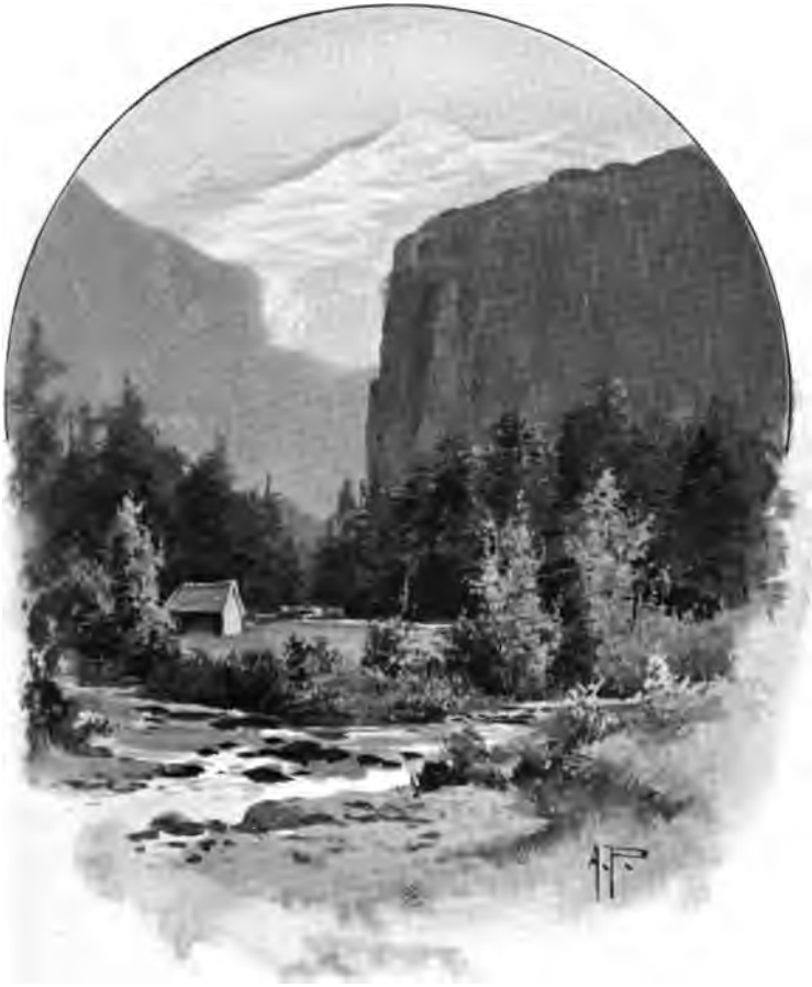
JUNCTION OF THE UMPYR AND LESSER LABA STREAMS.

Umpyr stream. But we only heard one stag calling during the whole afternoon, and even this one did not allow us sufficient time to approach him. The walking was very difficult along the steep, wooded