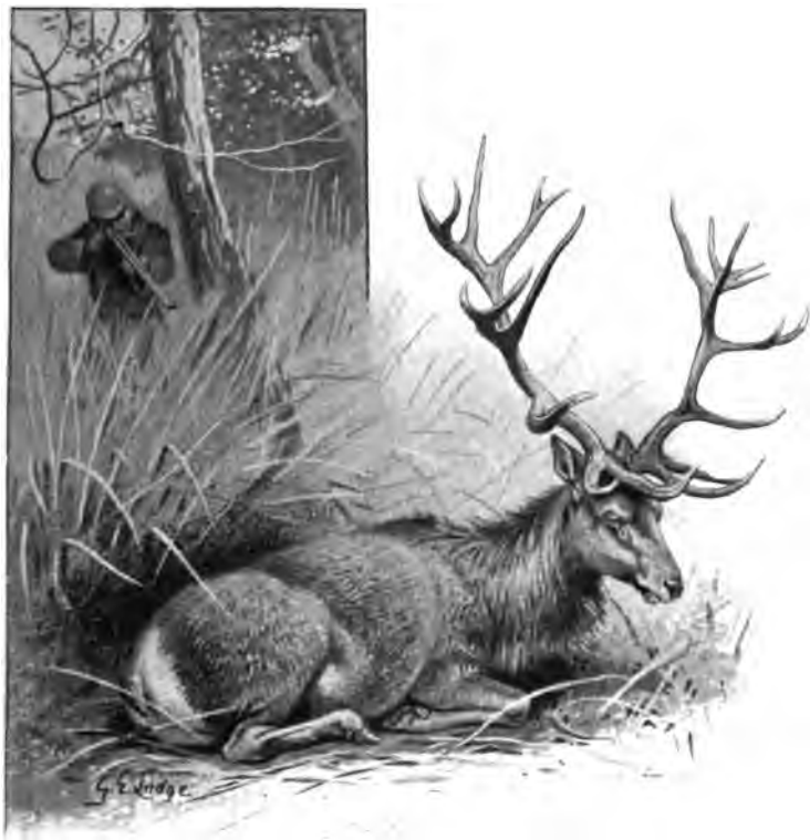
"FINDING HIM ASLEEP A FEW YARDS OFF."

a long time saw nothing save old tracks of aurochs and stags, which denoted at any rate that this part of the country was not devoid of game.