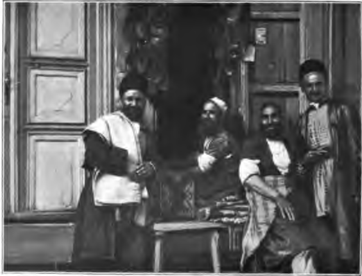
IN THE BAZAAR, TIFLIS.

At 4 a.m. one morning we drove out to the abattoir , and found a large number of these carrion feeders taking their breakfast in close company with a herd of half-wild pigs, whose erect hair down the spine and long snouts give them an ugly appearance, and made