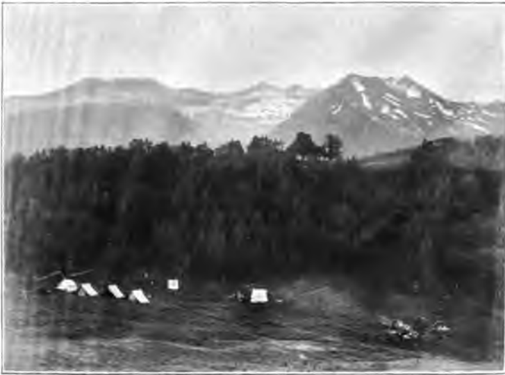
OUR CAMP ON THE PASS, ZELLENTCHUK-LABA.

It was impossible to stalk them directly and from below, as it would have necessitated crossing several snow slopes in full view, while to have approached