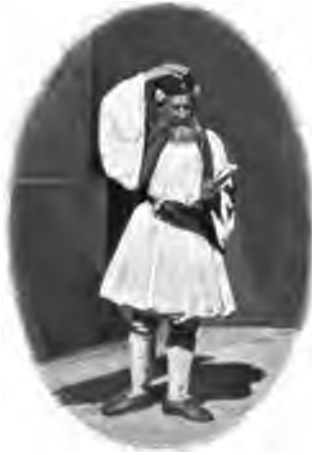
GREEK IN NATIVE COSTUME.

six miles to Athens. The road passed through a parched and barren-looking country, glimpses of which were only to be had through the clouds of dust that accompanied us. At Athens most of our time was