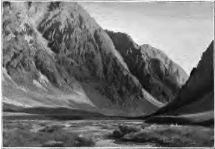
VALLEY OF THE ARAXES.

escort, and for obvious reasons an armed force could not be taken into Persian territory without previous negotiation. So far as one could see, the formation was similar to that on the north or Russian side, and from the direction in which the outcrops of the strata