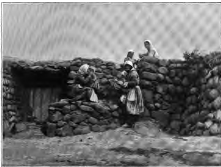
VILLAGE HUTS AND NATIVES, BAZARDJOUK.

that the natives with their antiquated weapons were a good match for us. It was marvellous what accuracy they showed, and this exhibition of the deadliness of their aim made us feel thankful that they were in camp with us helping to protect us, and not hostile.