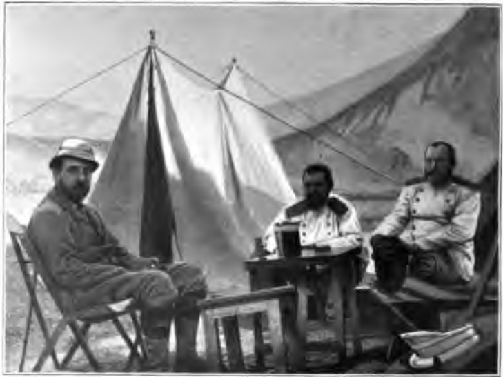
ON THE PERSIAN FRONTIER.

estimated to be over 100 years old, it was quite a youngster, for this species grows to a very large size, and is said to attain an age of over 700 years. Although it had already lived for a considerable number of years, it was quite edible. The haul