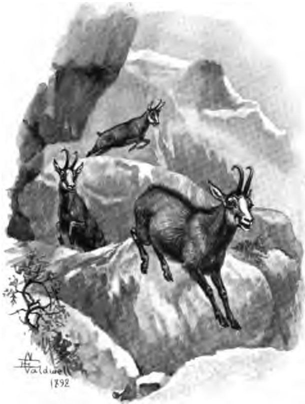
"GALLOPING OFF IN FRANTIC DISORDER."