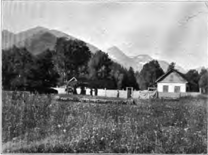
GOVERNMENT FORESTER'S HOUSE.