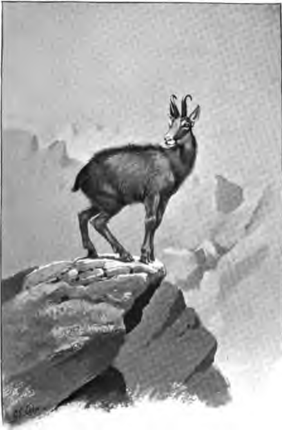
THE SENTINEL CHAMOIS.

missed a Bear at long range, and secured a Chamois. The Grand Duke had not been able to find his wounded Bison; though blood was plentiful, the tracks led into difficult ground, and the chase had to be abandoned.