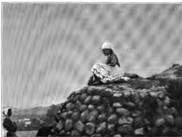
A NATIVE GIRL, BAZARDJOUK.

inspection of one of these places. The cave-like dwelling was divided into two compartments, one for the family, and the other, if one may judge by the odour which emanated from it, for their cattle. The walls on the inside were just the same unadorned