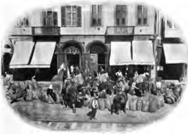
ON THE QUAY, SMYRNA.

these various gentlemen, I think there is some truth in the old saying, which implies that in any transaction a Greek can get the better of it over two Jews, whilst an Armenian can give points to all three combined.