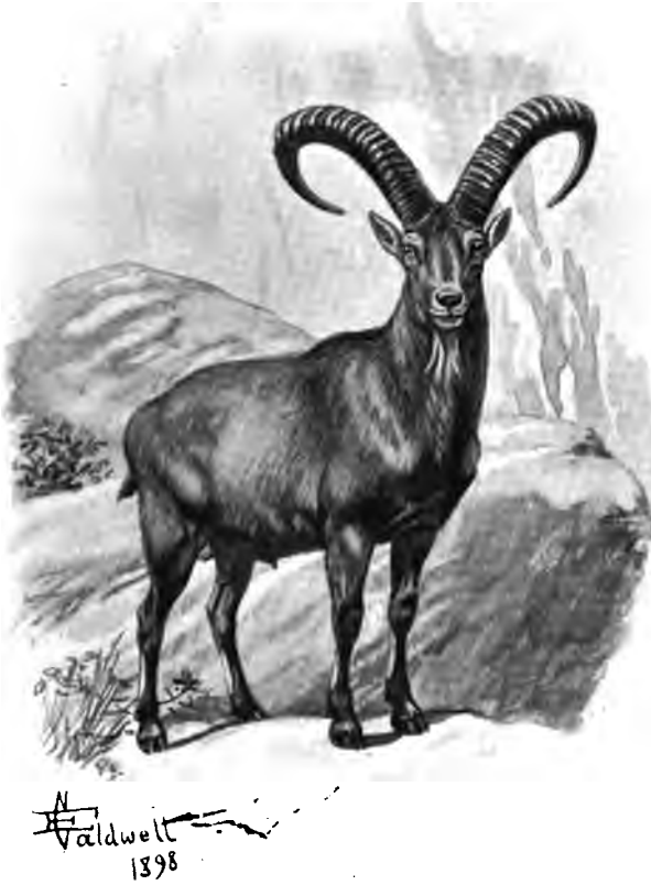
THE IBEX OR TÛR.

divergence of habit. But there seems no reason to separate them as distinct species.