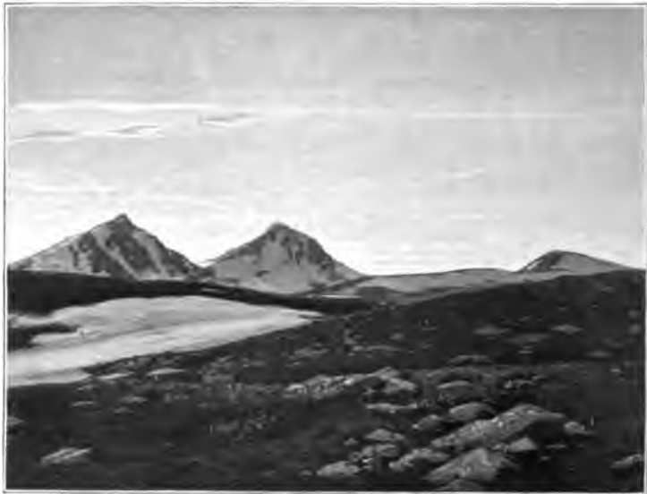
VIEW OF THE ALAGUEUZ PEAKS.

Owing to our strange surroundings and expectations