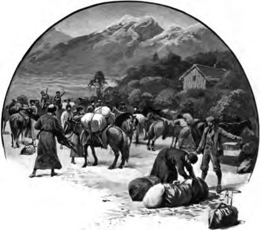
PREPARING FOR THE START.