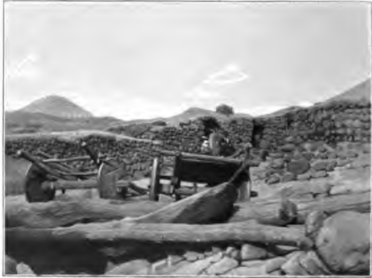
NATIVE CARTS, ERIVAN.

extent in this district, resembled pea-soup in appearance and consistency. Some of the land more favoured in its water supply was sufficiently fertile to grow corn. Harvesting was nearly at an end, and we had an opportunity of observing the curious method of thresh-