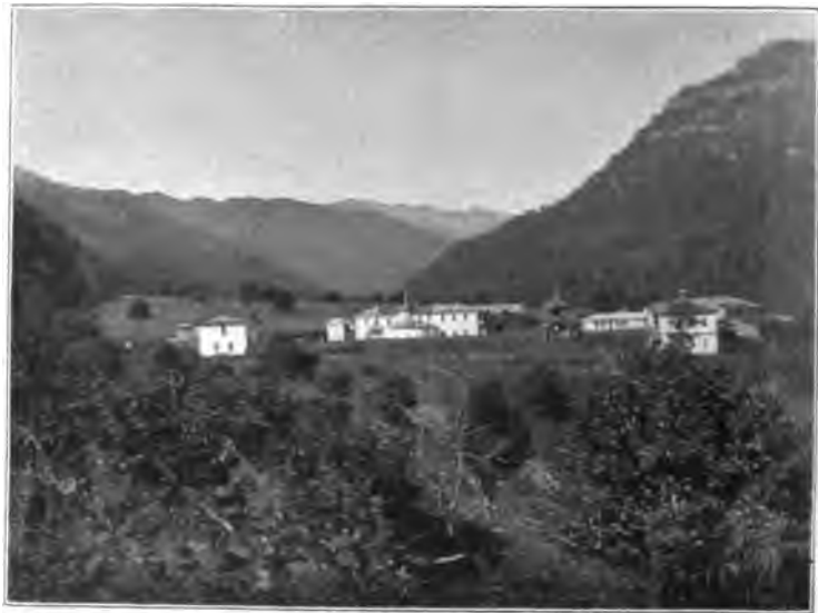
MONASTERY AT ZELLENTCHUK.

diminuendo produced a somewhat striking and weird effect. We became the guests of the Father Superior, and received the attention and hospitality which their frugal mode of living afforded. Close to the monastery are ruins of two ancient churches; they date back