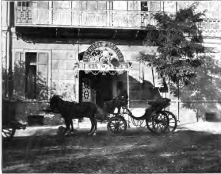
HOTEL DE LONDRES, TIFLIS.