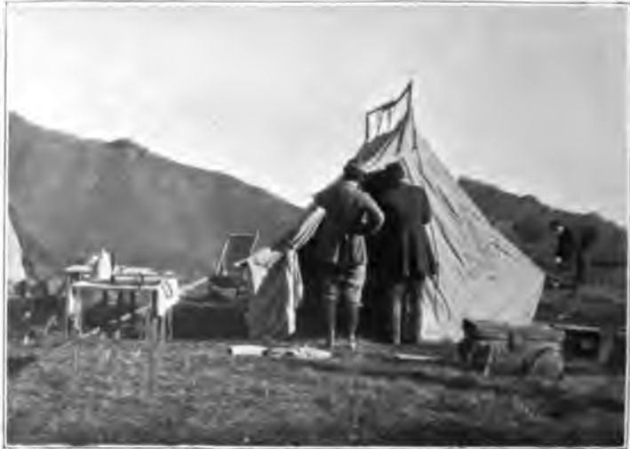
OUR TENT AFTER THE FIRE.

had added materially to our comfort as the weather became colder. Two nights before leaving the Urup valley, soon after turning in, I was aroused by the cries of "Fire!" and, on turning out, found the fly of D.'s tent in flames. The heated chimney coming