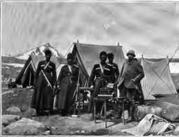
OUR CAMP ON THE ALAGUEUZ.

out four or five large corries and ridges, he returned to camp disappointed, having seen no evidence either of Moufflon or Ibex beyond a questionable track on the top of one of the ridges. The only living things he saw were a couple of mountain Black-cocks. Mr.