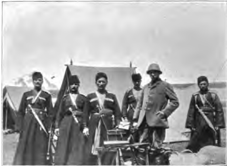
NATIVES AND SERVANT, ALAGUEZ.

The oxen, on the other hand, though not so nimble, showed such marvellous carrying powers that they succeeded in this difficult ascent without help.