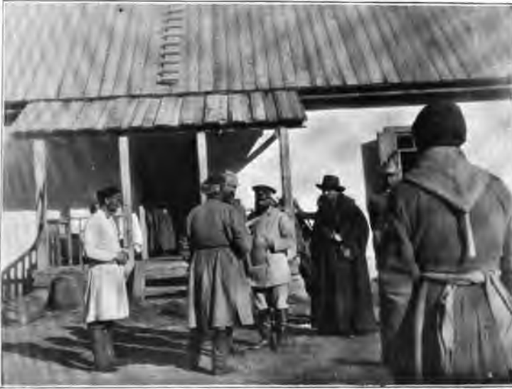
PREPARATIONS FOR THE START.

We stayed another night at the forester's house, and having said good-bye to the Father Superior and the Forest-Inspector, proceeded on our way up the Zellentchuk valley for a distance of about 20 versts, and camped at an elevation of 5000 feet