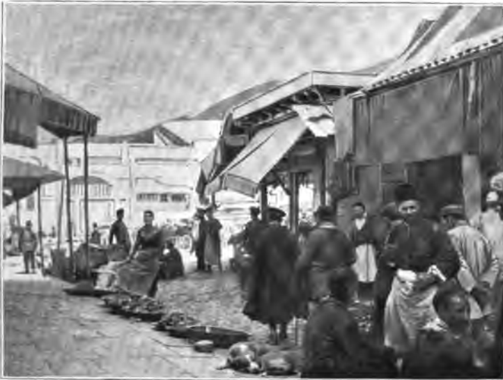
THE BAZAAR, TIFLIS.

As the sanitary authorities of Tiflis allow no slaughter-houses in the town, it is compulsory that the supply of meat be prepared at an abattoir some