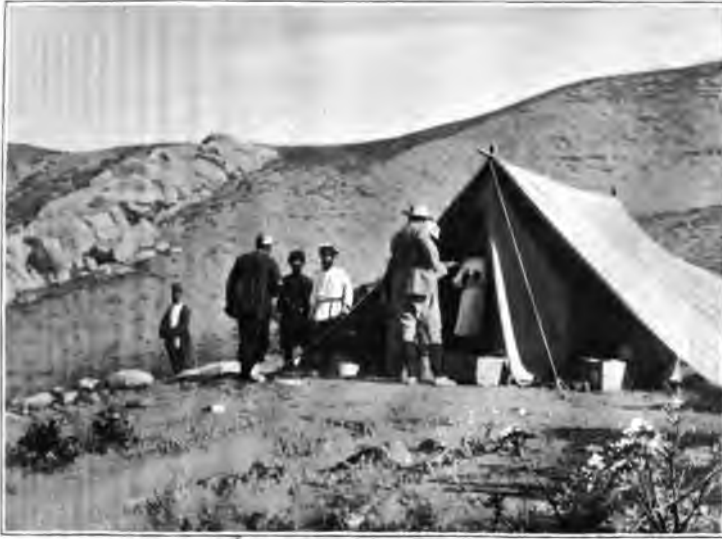
ON THE ALAGUEZ MOUNTAINS.

After this disappointment nothing more was seen except a view of a Wolf disappearing in the distance, and I contented myself with the less exciting amusement of collecting a few of the Alpine plants which were to be found in great abundance at this altitude of between 10,000 and 11,000 feet.