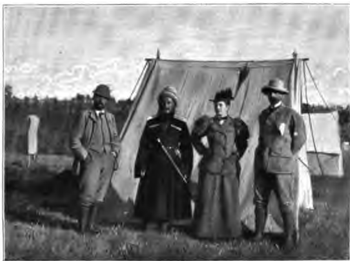
OUR LAST CAMP.

On the 24th September we lifted camp, and after a march of about thirty versts halted about ten versts from Storojevoi. On the following morning we rode