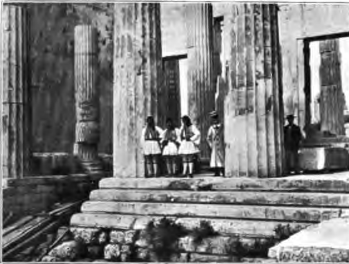
THE ACROPOLIS, ATHENS.

The Piræus was the first port we touched at, and as we were to stay four or five hours, we decided