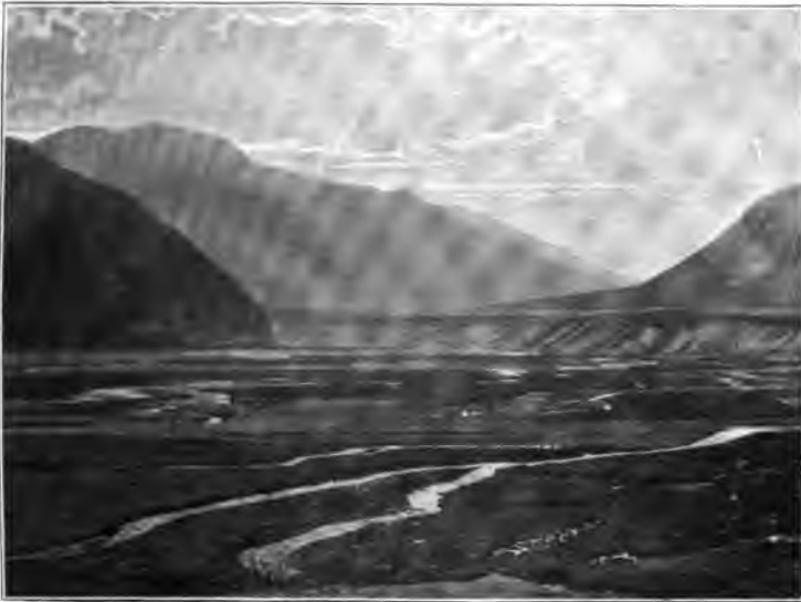
VALLEY OF THE TEREK, GEORGIAN ROAD.

About forty versts before we reached the pass which