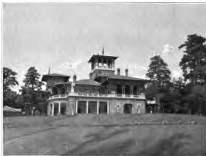
THE GRAND DUKE NICHOLAS' RESIDENCE, BORJOM.