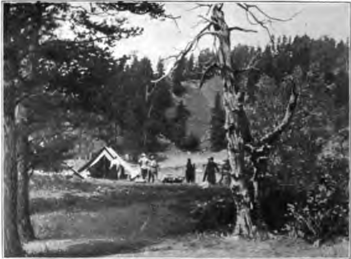
PITCHING CAMP IN THE ARKHYZ VALLEY.

descended precipitously to the irregular ground below. The genial rays of the sun acted for such a short time in the day, that tracks of eternal snow extended steeply to the valley below, whilst the deeper corries were filled in so as to form steep and dangerous