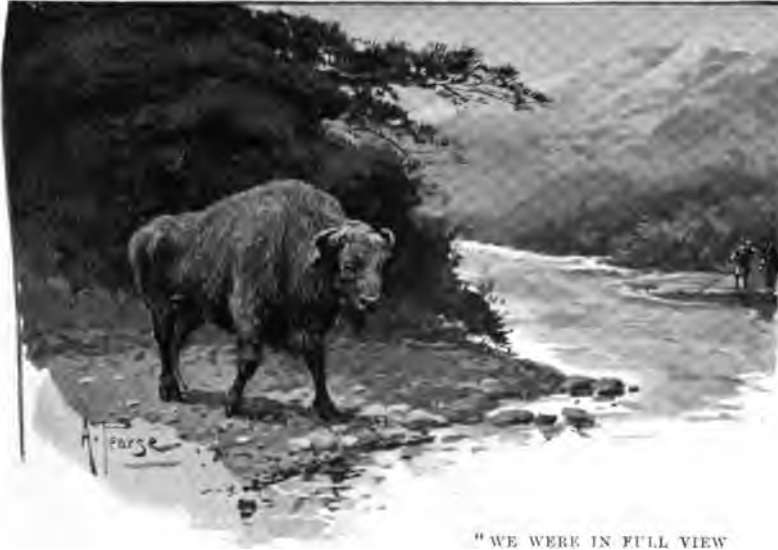
"WE WERE IN FULL VIEW OF THE BISON."

action I caught sight of the animal stumbling over stumps of trees, and trying to make his way through the dense underwood. Lowering my rifle and aiming at his huge head, I fired both barrels at him. As he