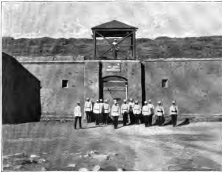
RUSSIAN FRONTIER POST, NEGRAM.

river. Their method was to drag a net attached to two poles up and down the river; the man who worked at the end farthest from the bank waded waist-deep for some distance up-stream, and then wheeled into the bank. Their haul contained several