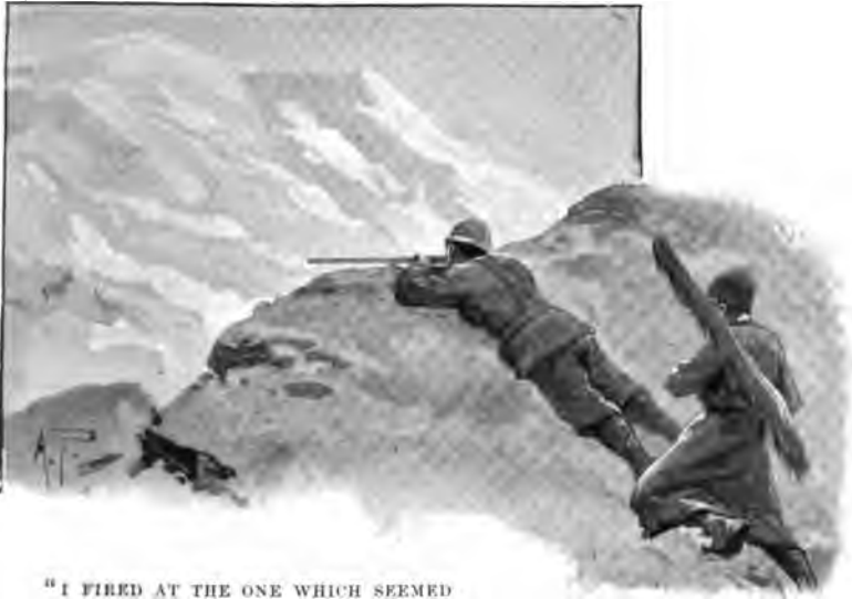
"I FIRED AT THE ONE WHICH SEEMED TO CARRY THE BEST HEAD."

15 stone weight. When the hunters came up we waited awhile, watching the other two animals which had already nearly reached the topmost ridge, and after standing for a time on the sky line, disappeared from view.