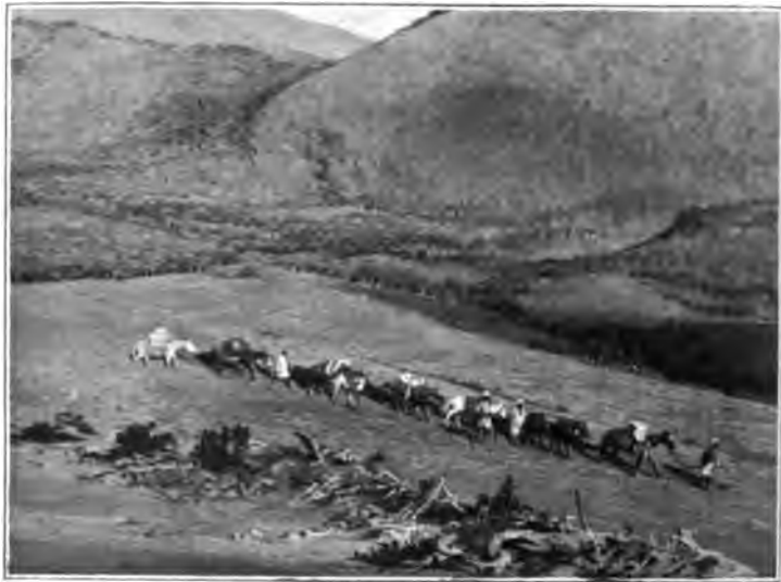
OUR WAY OVER A PASS FROM THE ZAGDAN VALLEY.