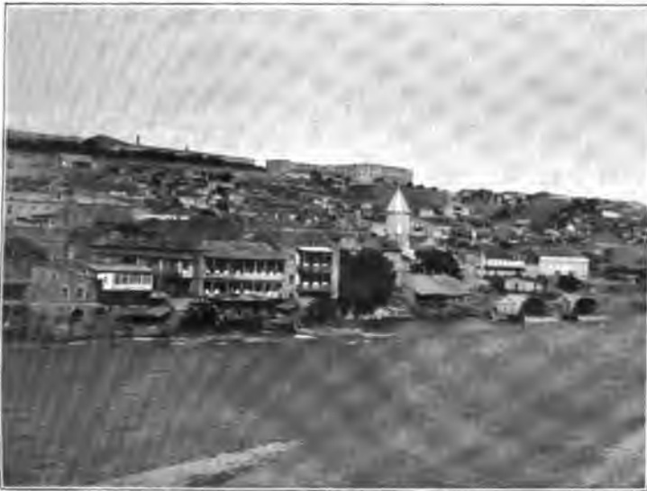
TIFLIS FROM THE KURA RIVER.

calculating machine, consisting of a number of bobbins in a rickety frame, and it was only our impatience to be going that brought about a unanimous opinion, and prevented what appeared to be an imminent fight amongst themselves as to what we were to be charged.