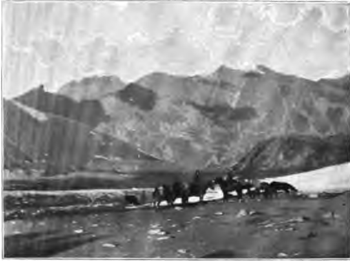
A HALT BY THE SNOW.