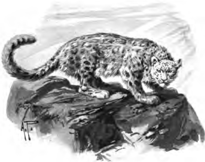
THE SNOW LEOPARD.

This curious episode was the topic of our conversation until the Grand Duke left our caravan with the