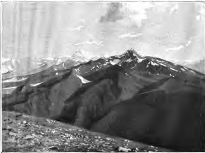
HILLS AND MAIN RANGE, CAUCASUS.

himself about half an hour afterwards. They had not been very much disturbed, so we followed them up and found them quietly feeding about two miles further on. They got our wind again, and did not stop until they were out of sight. We now returned