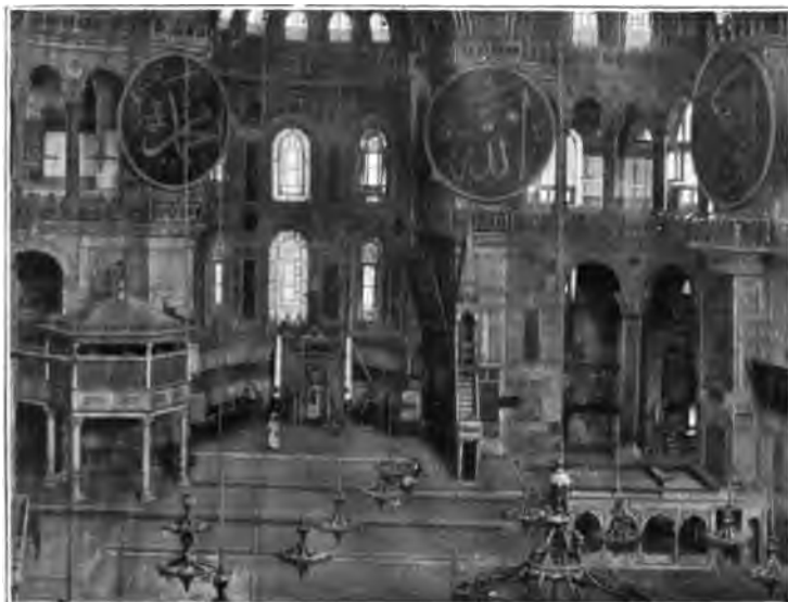
INTERIOR OF ST. SOPHIA, CONSTANTINOPLE.

safe for Europeans to be seen in the neighbourhood, the quarter being exclusively Turkish. The great national cemetery of the Turks is in the same locality, in which the many acres of tombstones