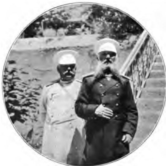
RUSSIAN OFFICIALS, ERIVAN. (PRINCE NAKASCHIDZE.)

with great pomp and ceremony specimens of the staple industries of the country, such as carpets and tapestries, they carefully avoided soliciting a bargain for fear the Vice-Governor might "request" them to part with their goods at a reasonable price. After